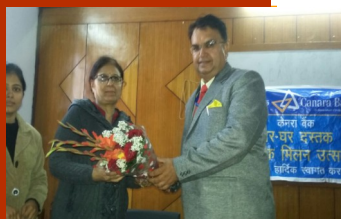
Vitiya Saksharta Abhiyan